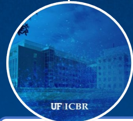
TBD OPS Bioinformatics Technician Bioinformatics