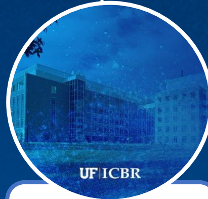
TBD Core Research Facility Specialist I, Electron Microscopy