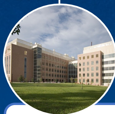
TBD Core Research Facility Specialist I, Electron Microscopy