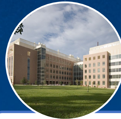
TBD Proteomics OPS Lab Technician Proteomics & Mass Spectrometry